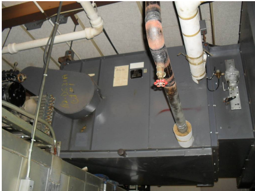
Figure 8 – Gym/Multipurpose AHU

The only cooling in the facility is located in the administration area. There are five Mitsubishi, model MS09TW split system ductless AC units. The associated condensing units are all installed on the roof of the facility. A typical condensing unit may be seen in the Figure 7 photo adjacent to the energy recovery units.