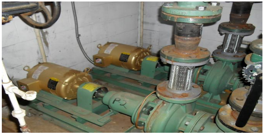
Figure 5 – Base mounted pump variable speed drives