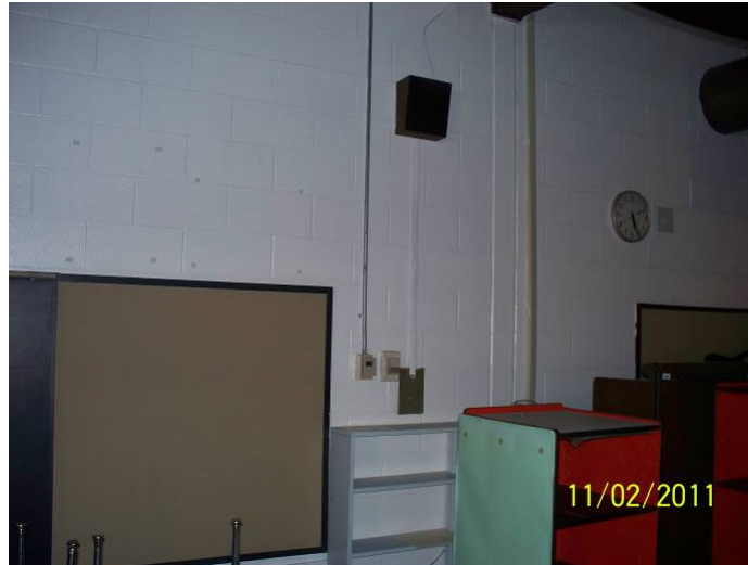
Typical classroom speaker