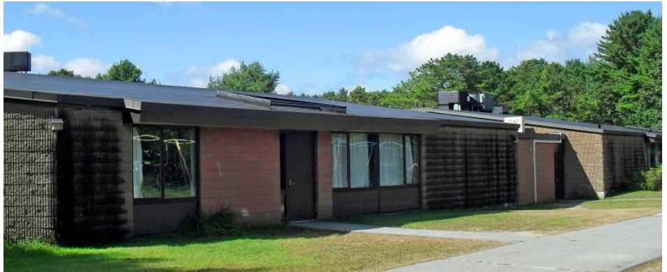
Northeast facing wall with no sun exposure

Water from roof runs down face of scored, split-faced block. Note overhang at windows and smooth block.