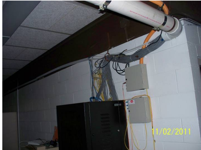
Data Cabling run in DWV pipes