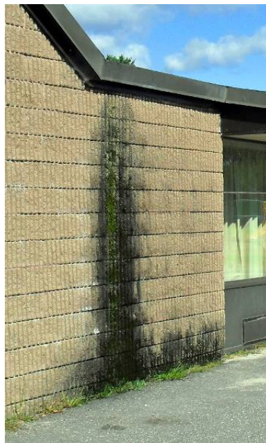
Southeast side with sun exposure