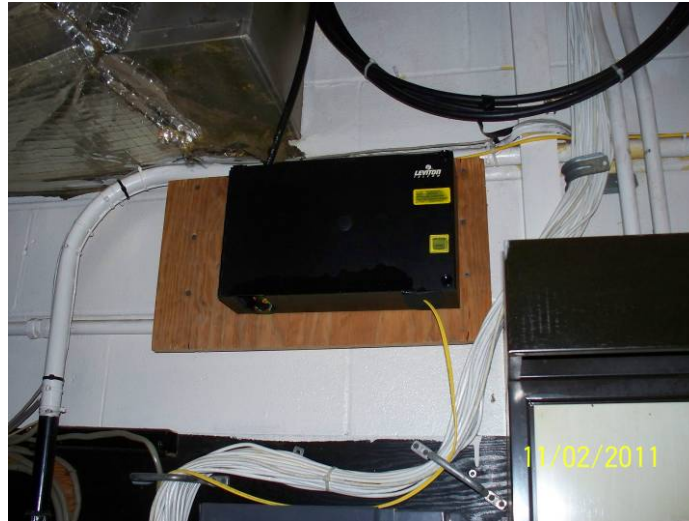
Fiber Splice Box (2)