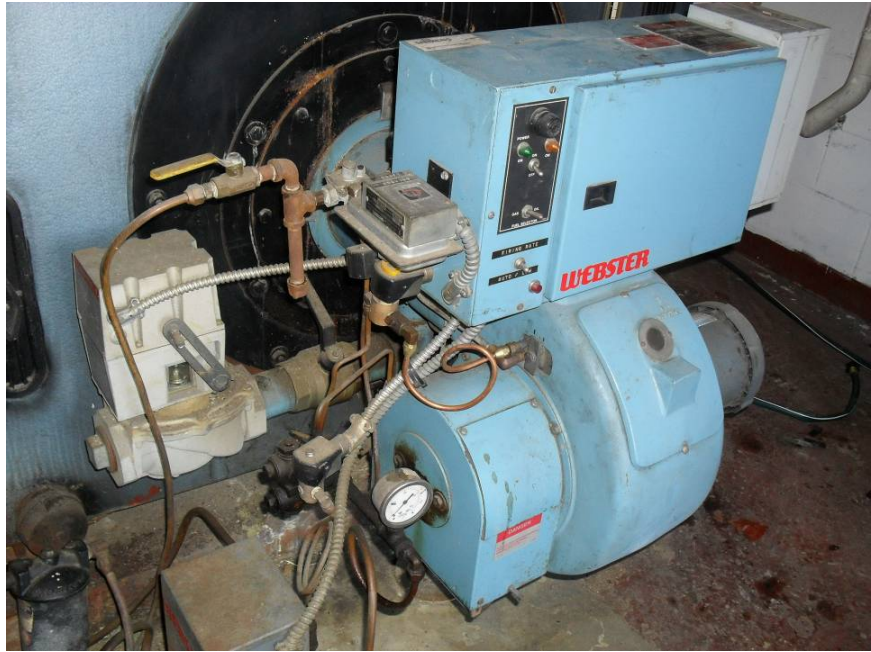
Figure 2 – Oil Burner

There is one existing steel underground fuel storage tank with an interstitial monitoring system in the tank and one in-ground monitoring well located just outside the boiler room. Underground suction and return piping runs from the tank into a pit in the corner of the boiler room. The oil piping connects to a duplex fuel oil transfer pump set located in the boiler room which brings the oil in from the tanks and circulates it through a pressurized distribution loop. The burner pulls oil off the distribution loop at a quantity matching the burners firing rate.