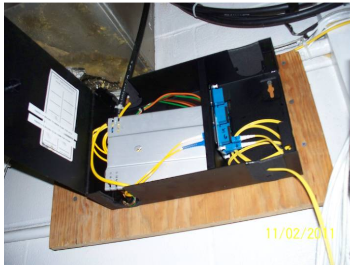
Fiber Splice Box (3)