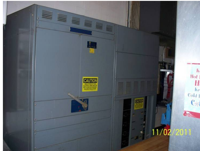
Service Entrance Switchboard

The main switch and adjacent I-Line distribution section, both rated at 1600A, appear to be “original” equipment (1972 - 40 years), but are in good serviceable condition. The distribution section has a variety of breaker sizes serving the existing sub-panels and some limited space for future breakers.