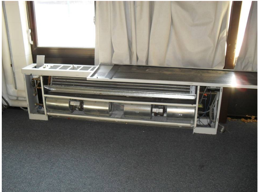
Figure 7 – Typical new Energy Recovery ventilators