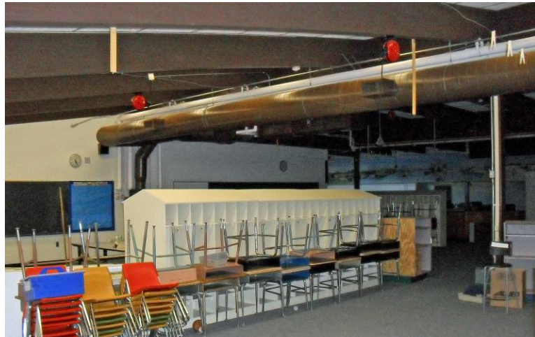
Typical Open Classroom Pod

Ceilings in the open areas are exposed wood fiber decking that also serves as the roof deck. Some of the interior office spaces have suspended acoustical tile. Ceilings appear to be in good condition.