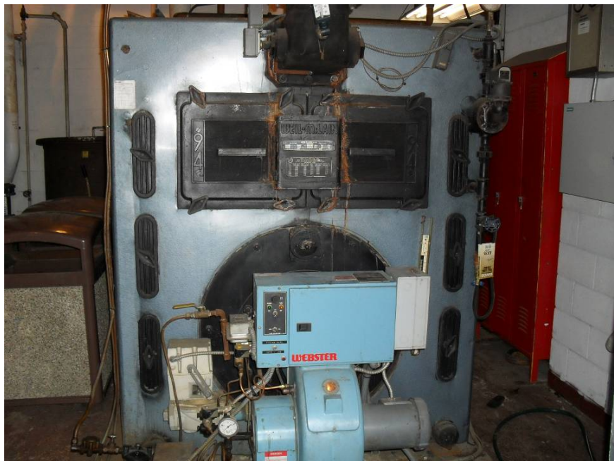
Figure 1 – Cast Iron Boiler

The boiler produces 180 degree heating hot water which is distributed throughout the entire facility via insulated schedule 40 steel piping. An induced draft fan that is located at the rear of the boiler is provided to assist with boiler draft control. The boiler is equipped with a Webster Cylcometic burner which burns No. 2 heating oil. The burners model number is JB2C-30-R77950. The burner is equipped to also burn natural gas; however, natural gas is not available at the site.