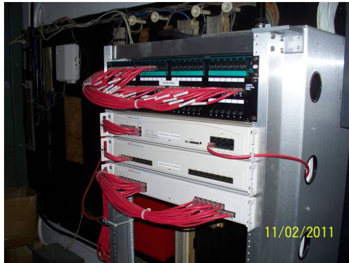
Phone System (3)