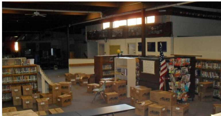
Library is at lower elevation than rest of building. Ramp is behind shelving in center of picture.

Access to the library is limited to the right side of the building only, meaning a person in a wheelchair would have to travel from the left side of the building through the multi-purpose space to get to the right side of the building in order to use the ramp down into the library. If the building configuration is maintained, an additional ramp should be added to provide access from both sides of the building. General circulation from one side of the building to the other side of the building is also impeded because travel requires going through the multi-purpose space or through the library.