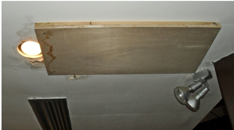
Water damaged ceiling in Library

The building has been reroofed since it was originally constructed. The current roof is EPDM and appears to be in relatively good condition, although there was a report of one area leaking in the library.