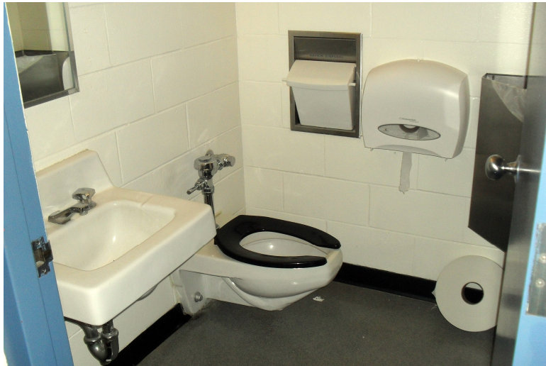
Non-compliant single user toilet room

With the exception of one or two toilet rooms, none of the staff or student toilet rooms are compliant with ADA requirements. Even the toilet rooms that have been partially modified are not be fully compliant. All toilet rooms would need to be completely renovated and enlarged to provide proper fixtures and adequate clearances. In lieu of fully renovating all toilet rooms, at least one accessible toilet room per gender should be provided in each wing. However, fully renovating the toilet rooms would also update the plumbing fixtures with water conserving fixtures as described in the mechanical section of this report.