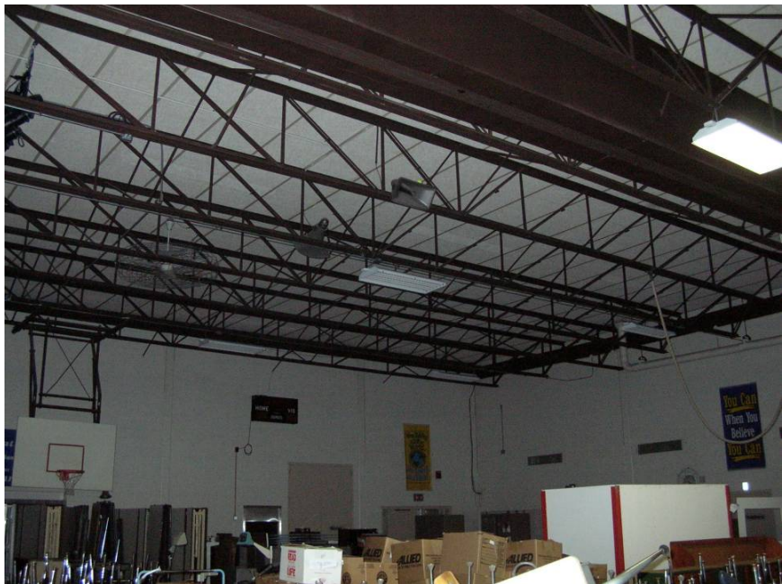
Roof Framing at Gym

The roof framing in the gymnasium consists of the same 2 1/2" Tectum decking and steel bulb tees spanning approximately 6 feet to 40" deep open web steel bar joists. The joists span approximately 67 feet and bear on steel wide flange beams and steel tube columns at the perimeter. The gym roof framing is higher than the surrounding wood roofs.