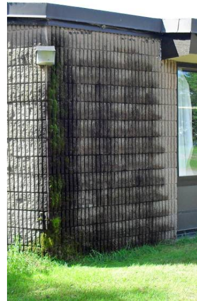
Northeast corner with no sun