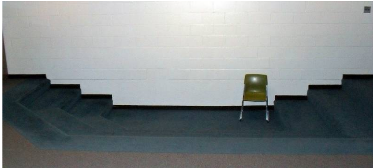
Stepped reading area in Library

With the exception of one or two toilet rooms, none of the staff or student toilet rooms are compliant with ADA requirements. Even the toilet rooms that have been partially modified are not be fully compliant. All toilet rooms would need to be completely renovated and enlarged to provide proper fixtures and adequate clearances. In lieu of fully renovating all toilet rooms, at least one accessible toilet room per gender should be provided in each wing. However, fully renovating the toilet rooms would also update the plumbing fixtures with water conserving fixtures as described in the mechanical section of this report.