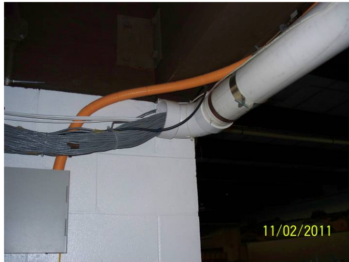
Typical Data Cabling routed in DWV pipe