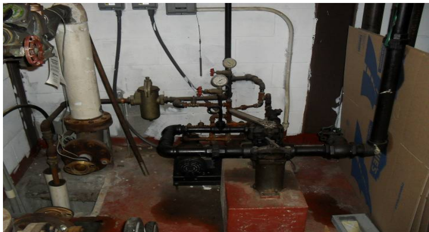
Figure 3 – Oil Transfer Pump Set

There is one existing steel underground fuel storage tank with an interstitial monitoring system in the tank and one in-ground monitoring well located just outside the boiler room. Underground suction and return piping runs from the tank into a pit in the corner of the boiler room. The oil piping connects to a duplex fuel oil transfer pump set located in the boiler room which brings the oil in from the tanks and circulates it through a pressurized distribution loop. The burner pulls oil off the distribution loop at a quantity matching the burners firing rate.