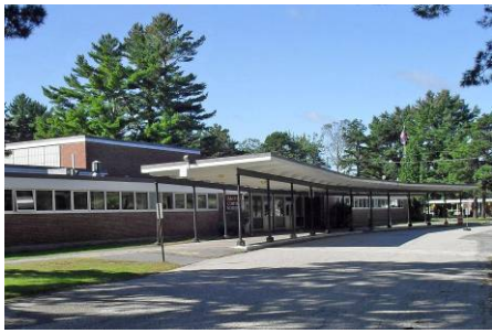
Coffin Elementary School

The Brunswick School Department currently operates four schools – Coffin Elementary School, Harriet Beecher Stowe Elementary School, Brunswick Junior High School and Brunswick High School. The total student population for Kindergarten through grade 12 is about 2,426 students as of 5/1/12.