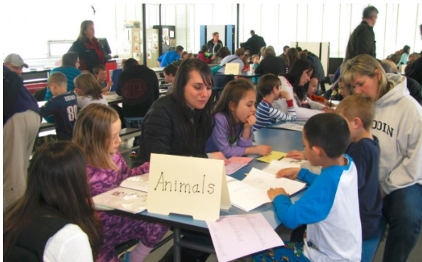
First graders share their writing during their Authors' Celebration of Non-Fiction Writing.