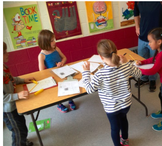
Students working on a differentiated math challenge.