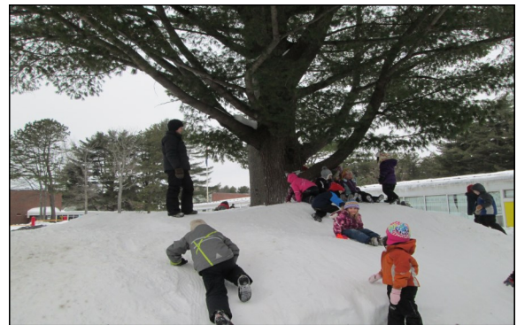
Kindergartners enjoying outdoor recess in the snow!