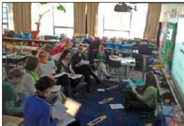
Members of our Response to Intervention - Behavior Committee (RTI-B) meet to work on a comprehensive school wide positive behavior support system that will be fully implemented in the 2015-16 school year.