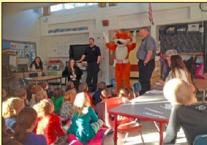
Red - 'E' - Fox joins two Kindergarten classrooms as part of our fire safety work with the Brunswick Fire Dept.