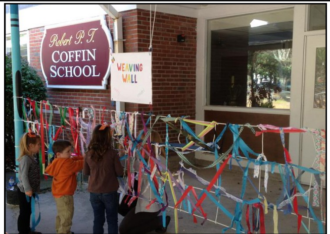
Students add to the weaving wall during our recent Coffin School Harvest Festival. Many thanks to Community for Coffin - our fantastic parent group - for organizing this perennially successful event.