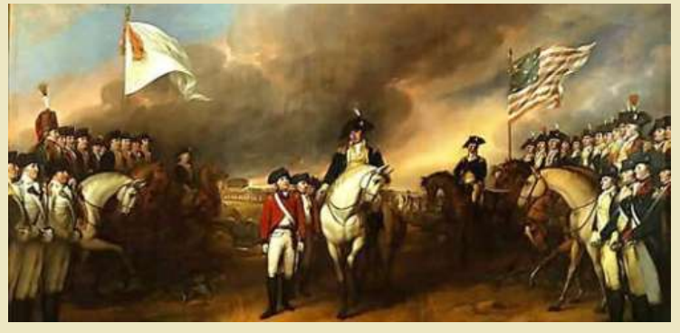
"The World Turned Upside Down"

The French band played the song "<u>Yankee Doodle</u>" which the British had used to make fun of the Americans. In response, the British band played a children's tune called "The World Turned Upside Down."