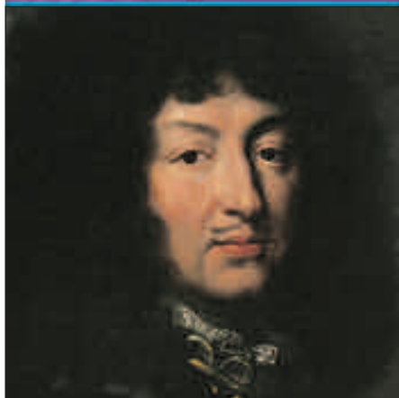
Louis XIV 1638–1715

Although Louis XIV stood only 5 feet 5 inches tall, his erect and dignified posture made him appear much taller. (It also helped that he wore high-heeled shoes.)