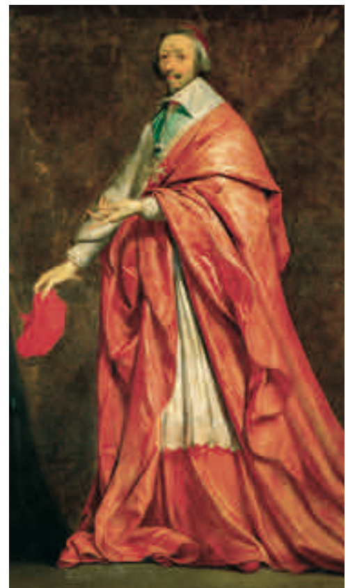
▲ Cardinal Richelieu probably had himself portrayed in a standing position in this painting to underscore his role as ruler.

Richelieu also wanted to make France the strongest state in Europe. The greatest obstacle to this, he believed, was the Hapsburg rulers, whose lands surrounded France. The Hapsburgs ruled Spain, Austria, the Netherlands, and parts of the Holy Roman Empire. To limit Hapsburg power, Richelieu involved France in the Thirty Years' War. A