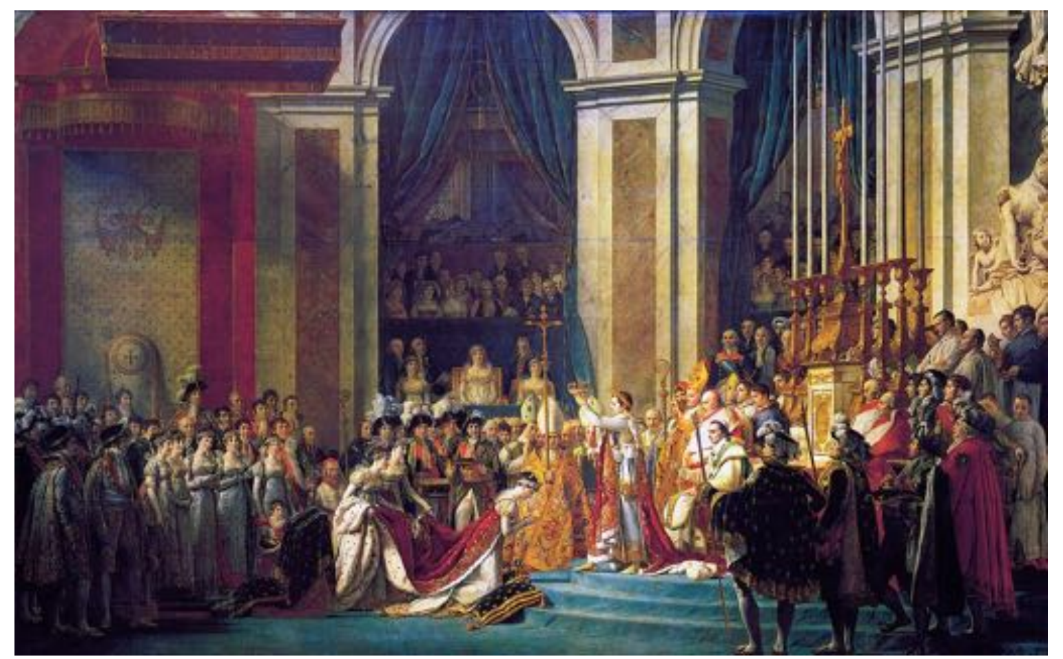
The Coronation of Napoleon by Jacques-Louis David

#1 - Napoleon is standing, dressed in coronation robes similar to those of Roman emperors. In the actual painting it is possible to see the outline of what was originally painted: Napoleon holding the crown above his own head, as if placing it on himself.