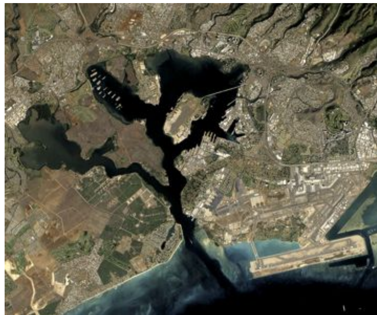
Pearl Harbor, Hawaii

called for the preservation of equal trading opportunities for all nations with _____