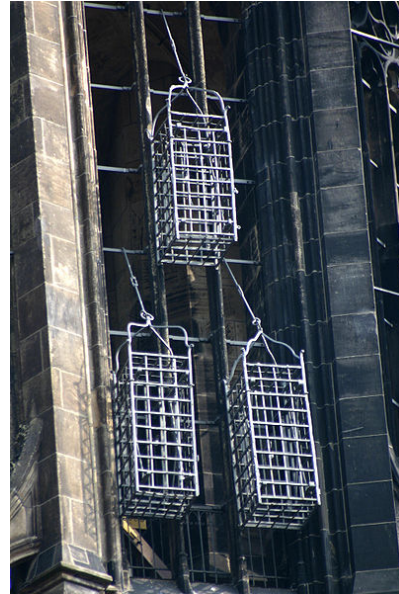
John of Leiden and several other prominent Anabaptist leaders were captured and imprisoned. In January 1536 John of Leiden and two other followers were tortured and executed in the marketplace of Münster. Their dead bodies were exhibited in cages, which hung from the steeple of St. Lambert's Church; the cages still hang there, though the bones were removed later.

1534: combined Protestant/Catholic army retook Münster executed Anabaptist leaders