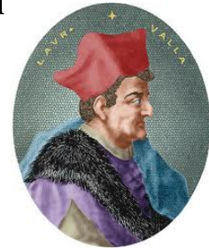
Lorenzo Valla (1407-1457)

wrote the first English translation of the Bible supported a return to simplicity and poverty his followers were called Lollards was convicted of heresy 75 years later by the Council of Constance