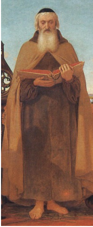
John Wycliffe (1328-1384)

English priest and early critic of the Catholic Church