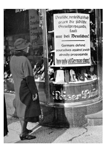
A woman reads a boycott sign posted on the wind ow of a Jewish-owned department store.

Jews have faced prejudice and discrimination for over 2,000 years and were often used as scapegoats