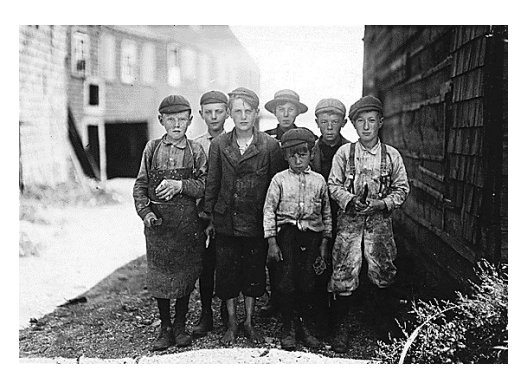
Some boys and girls were so small they had to climb up on to the spinning frame to mend broken threads and to put back the empty bobbins. Bibb Mill No. 1. Macon, Ga