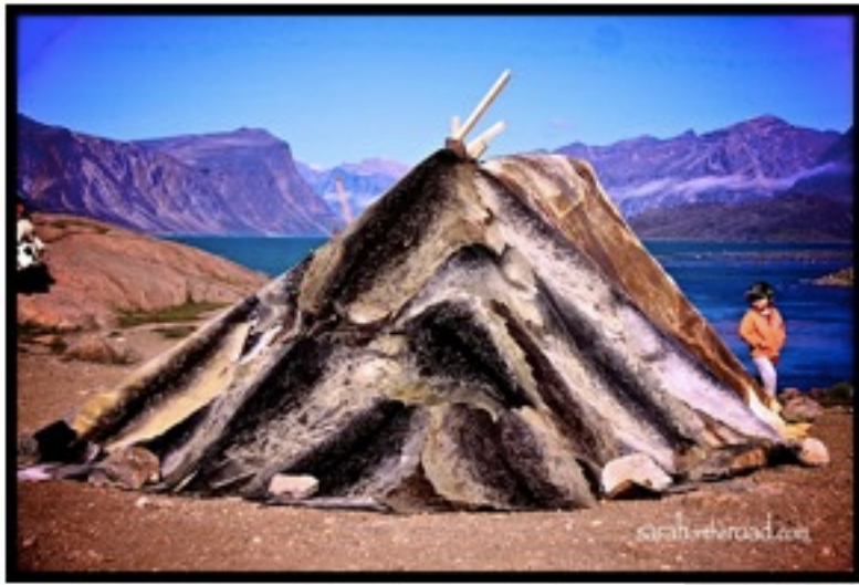
Inuit Shelter (summer)

summer homes were _____ sewn together and held up with sticks or _____ ribs