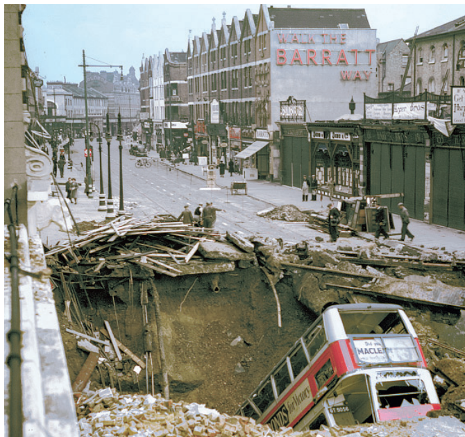
▲ A London bus is submerged in a bomb crater after a German air raid.

In the summer of 1940, the Luftwaffe (LOOFT•VAHF•uh), Germany's air force, began bombing Great Britain. At first, the Germans targeted British airfields and aircraft factories. Then, on September 7, 1940, they began focusing on the cities, especially London, to break British morale. Despite the destruction and loss of life, the British did not waver.