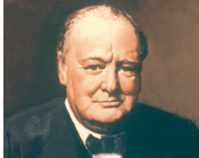
Winston Churchill 1874–1965

Possibly the most powerful weapon the British had as they stood alone against Hitler’s Germany was the nation’s prime minister—Winston Churchill. “Big Winnie,” Londoners boasted, “was the lad for us.”