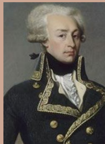
Marquis de Lafayette

3,000-4,000 - African Americans who left with the Loyalists at the end of the War