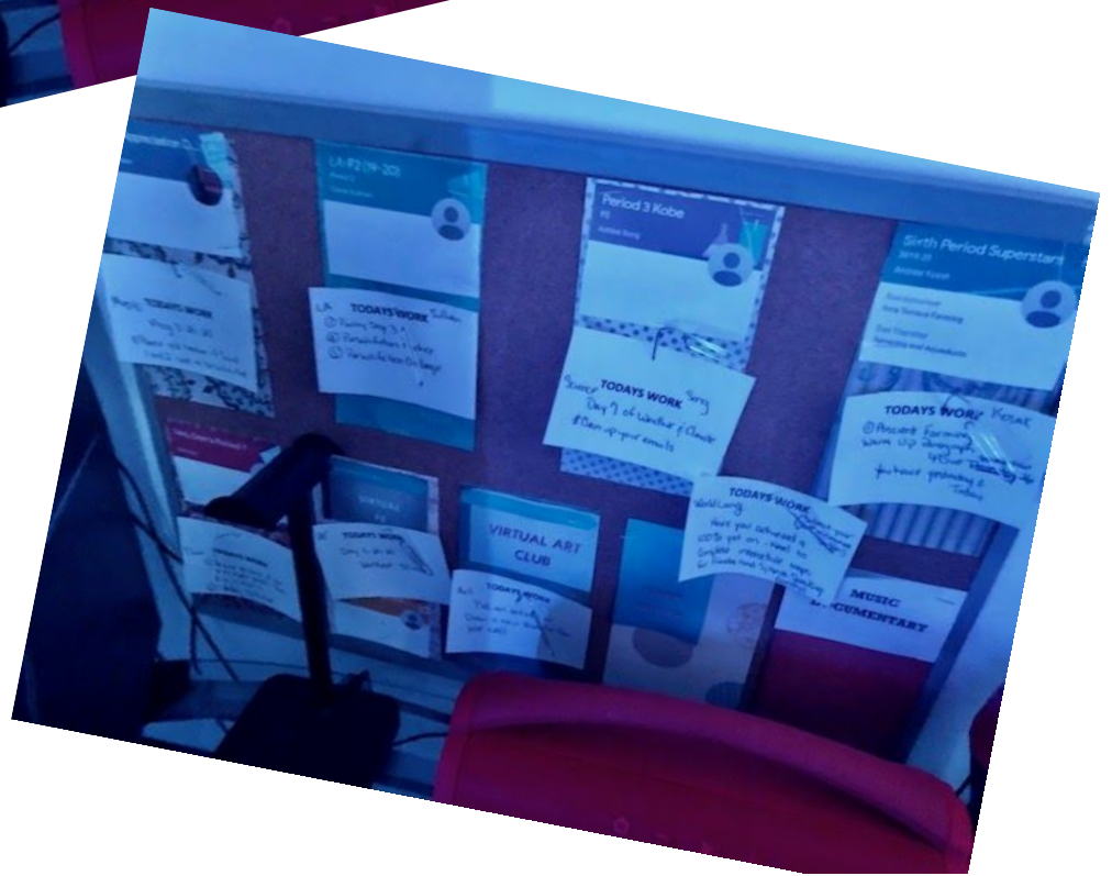
Seb's new "assignment notebook" is very impressive!