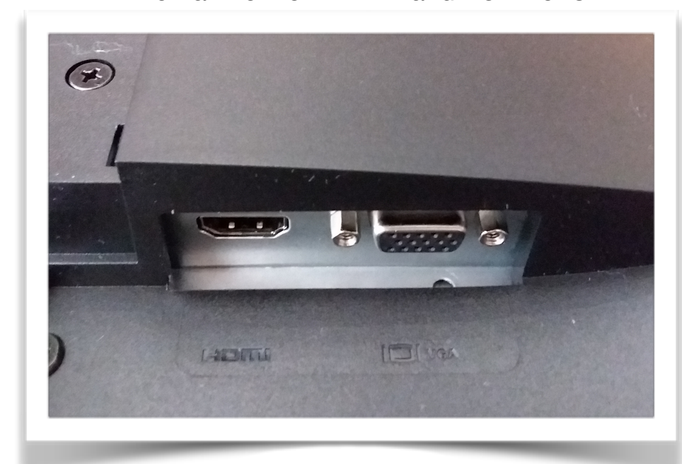
USB-C to HDMI