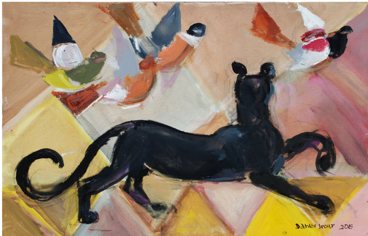
Dahlov Ipcar "Panther and Birds" Incomplete Oil on Linen 23" X 36" 2015

painting I've been trying to paint, and it's like I got this far, and I can't finish it. It's a panther and birds.