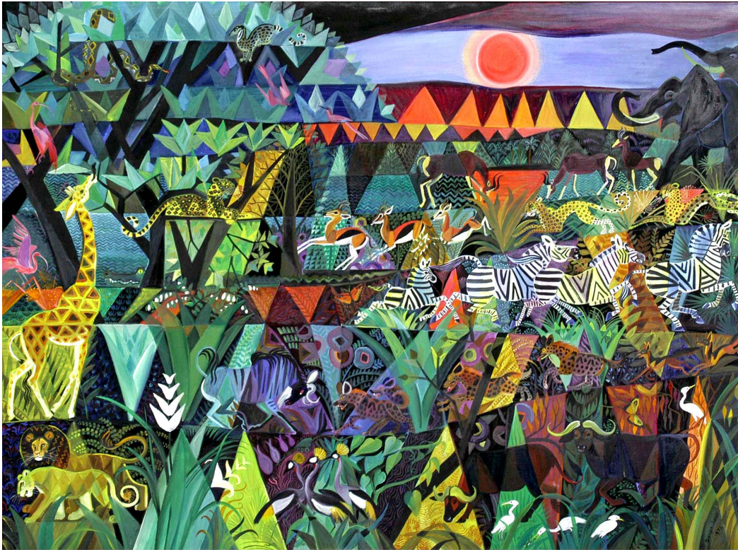
Dahlov Ipcar "Harlequin Jungle" Oil on Linen 40" X 50" 1972

PHILLIPS: It sounds like when you started a painting you'd have a sense of how big it would be. And you'd perhaps draw the design with charcoal?