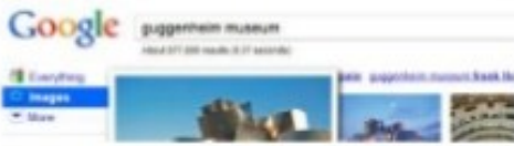
Image search: Do not cite the search engine where the image is found, but the website of the image the search engine indexes

*Note: URL is optional. Check with your teacher or librarian.